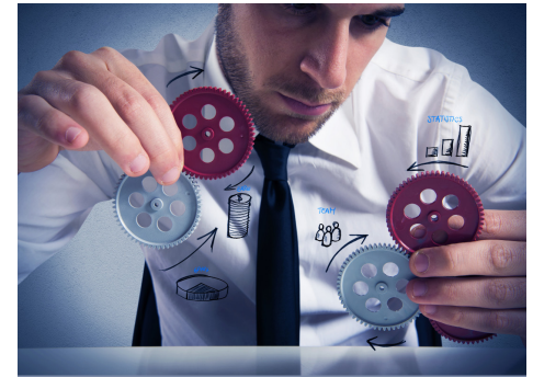
Autopilot Business Systems

How is it that some business owners seem to be working less hours and lack the marketing skills of their competitors, yet they are still able to scale and grow their business? You will find these entrepreneurs have simplified, systemised and automated large parts of their business 'machine'. The business doesn't rely on them to crank up the engine every day which reduces the risk for potential buyers because the business is not totally reliant on the owner. Too often a business run by a technician grinds to a halt when they aren't 'on the tools' or are sick. They find it difficult to take time off and rarely have a decent holiday. They build strong relationships with their key customers which might prove difficult to transition to the new owner. All these